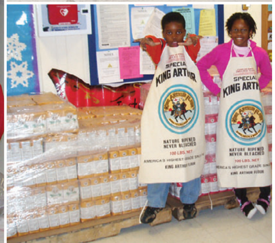
Flour may arrive on a big wooden pallet