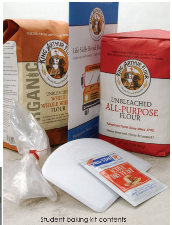
Student baking kit contents